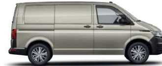
Ascot Grey (New)