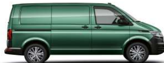
Bay Leaf Green (New)