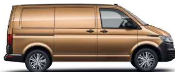
Copper Bronze (New)