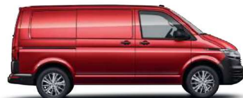
Fortana Red (New)