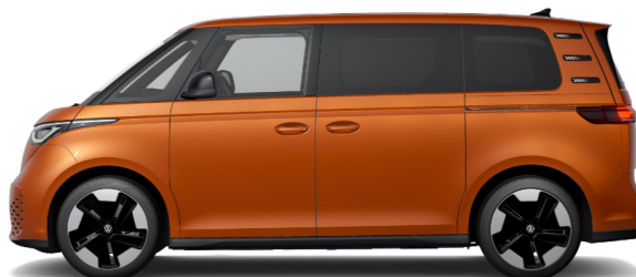
Energetic Orange Metallic 1 4M4M