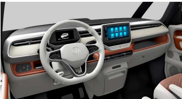
Saffron Orange-Mistral/Soul-Mistral/ Black