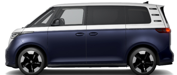
Candy White/ Starlight Blue Metallic 1