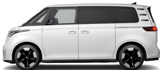
Candy White Solid 1 B4B4