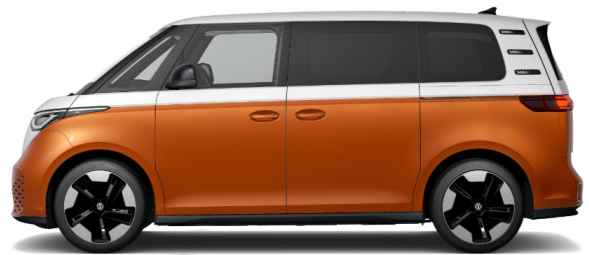
Candy White/ Energetic Orange Metallic 1