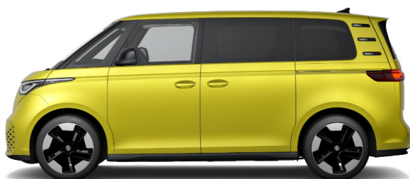
Pomelo Yellow Metallic 1 C1C1