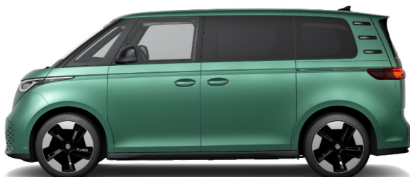
Bay Leaf Green Metallic 1 C4C4