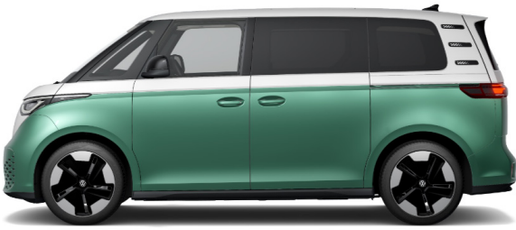
Candy White/ Bay Leaf Green Metallic 1