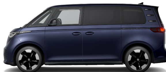
Starlight Blue Metallic 1 3S3S