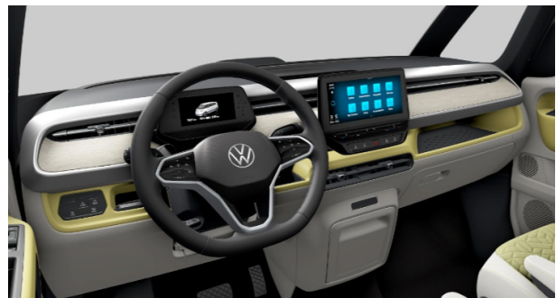
Black Steering Wheel & Infotainment Surround