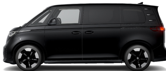
Deep Black Pearl Effect 1 2T2T