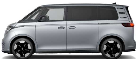
Mono Silver Metallic 1 K9K9