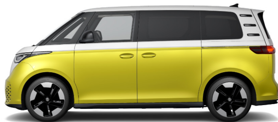
Candy White/ Pomelo Yellow Metallic 1