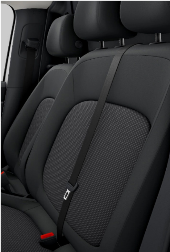
'Fabric' seat trim

Titanium Black-Soul/Soul-Soul/Palladium Standard on ID.Buzz Cargo, Comfort & Business