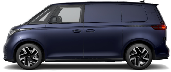
Starlight Blue Metallic 1 3S3S