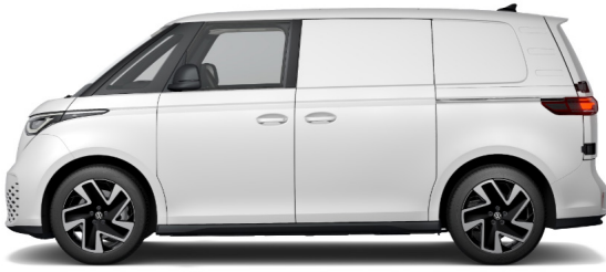
Candy White Solid 1 B4B4