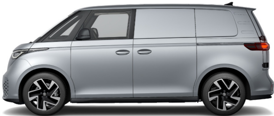
Mono Silver Metallic 1 K9K9