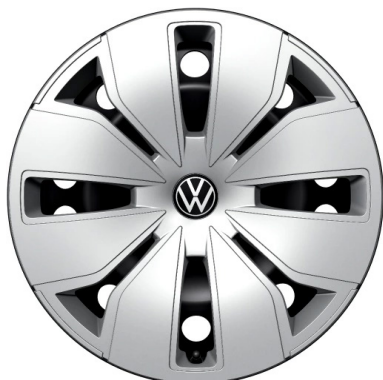
18" steel wheel (incl. trim)