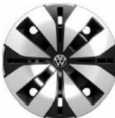
18" steel wheels (incl. bi-colour trim)