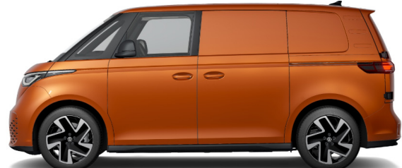
Energetic Orange Metallic 1 4M4M