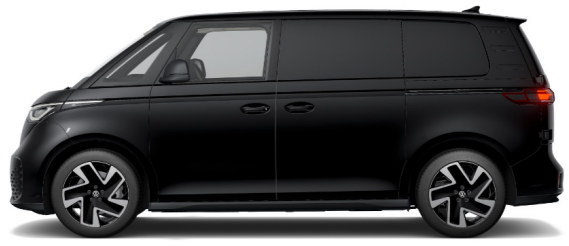
Deep Black Pearl Effect 1 2T2T