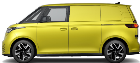
Pomelo Yellow Metallic 1 C1C1