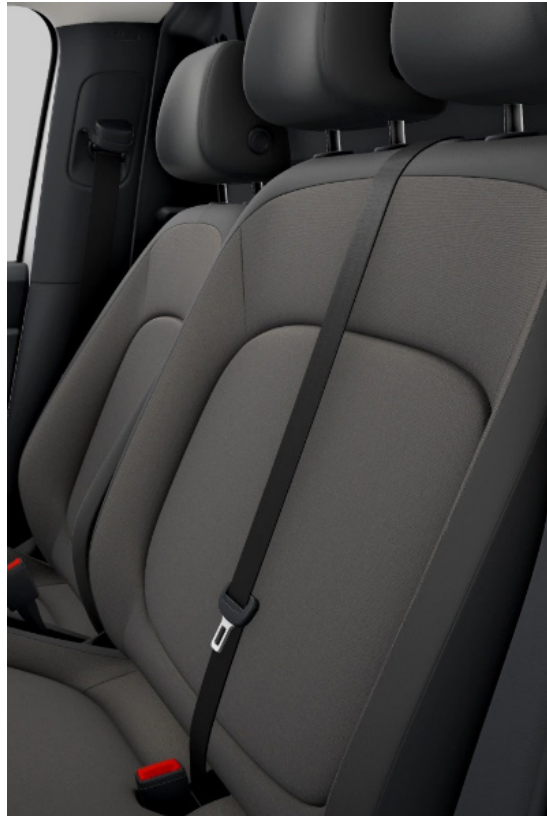
'Robust' seat trim

Titanium Black-Soul/Soul-Soul/Palladium Standard on ID.Buzz Cargo, Comfort & Business