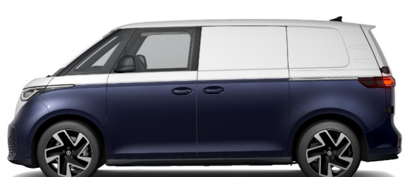
Candy White/ Starlight Blue Metallic 1 9530