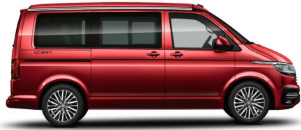
Fortana Red Metallic*