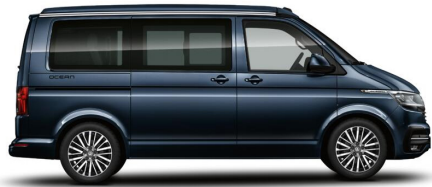
Starlight Blue Metallic*