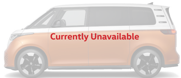
Candy White/ Energetic Orange Metallic 1