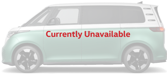
Candy White/ Bay Leaf Green Metallic 1