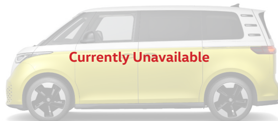
Candy White/ Pomelo Yellow Metallic 1