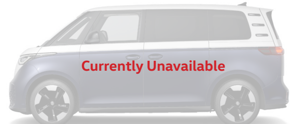
Candy White/ Starlight Blue Metallic 1