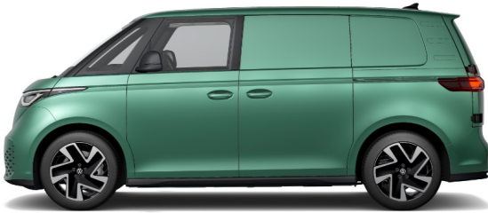
Bay Leaf Green Metallic 1 C4C4