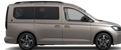
Mojave Beige Metallic