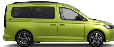
Golden Green Metallic