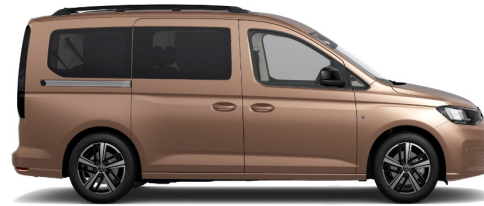
Copper Bronze Metallic