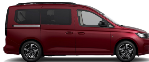
Fortana Red Metallic