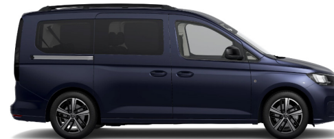
Starlight Blue Metallic