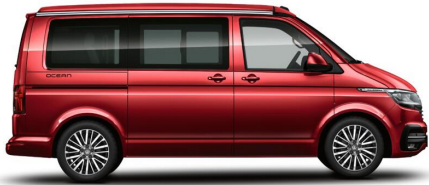
Fortana Red Metallic*