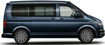
Starlight Blue Metallic*