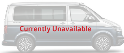
Reflex Silver Metallic / Starlight Blue Metallic*