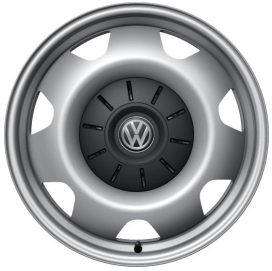
17" Steel Wheel

6.5J x 16, Silver Tyres 215/60 R17 C 109/107T