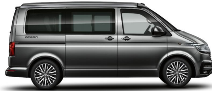
Indium Grey Metallic*