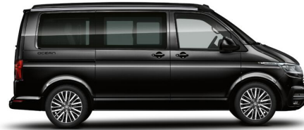
Deep Black Peal Effect*