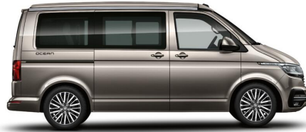
Mojave Beige Metallic*